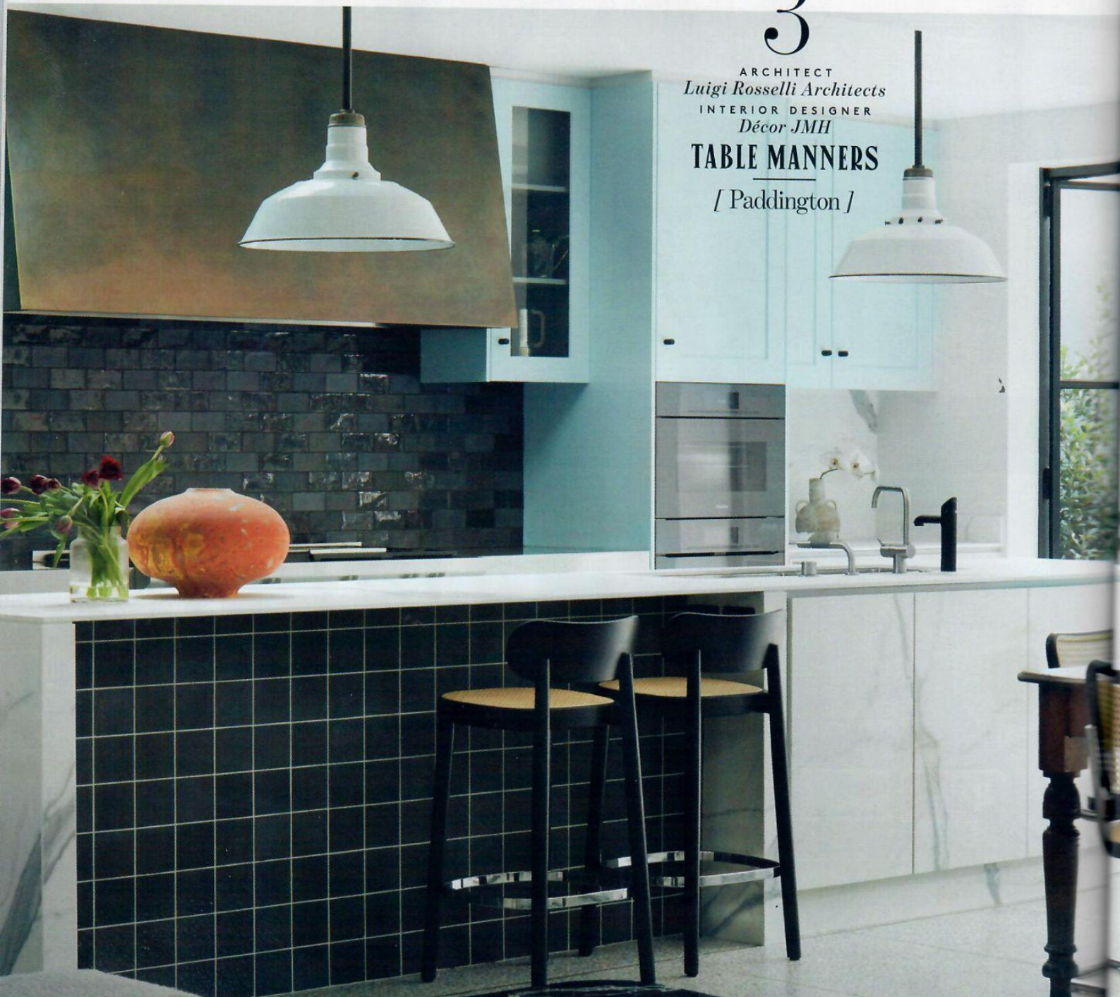
TABLE MANNERS [ Paddington ]

ARCHITECT Luigi Rosselli Architects INTERIOR DESIGNER Décor JMH