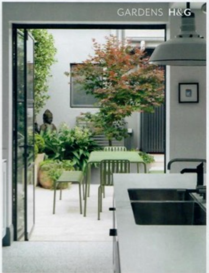
CLOCKWISE FROM ABOVE LEFT A trio of birch trees adds a vertical element to the front garden. The Japanese maple ( Acer palmatum 'Atropurpureum') brings seasonal colour and provides a lovely focal point when viewed from indoors. The Japanese maple foliage dances above the white blooms of New Zealand rock lily. A slatted screen hides the garage and doubles as a backdrop for the plantings, including tractor seat plant and cloud-pruned juniper. ▶